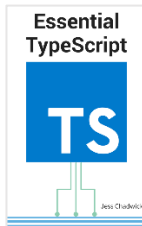
Essential TypeScript (LeanPub, May 2016)