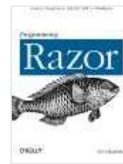
Programming Razor (O'Reilly, September 2011)