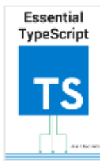
Essential TypeScript (LeanPub, May 2016)